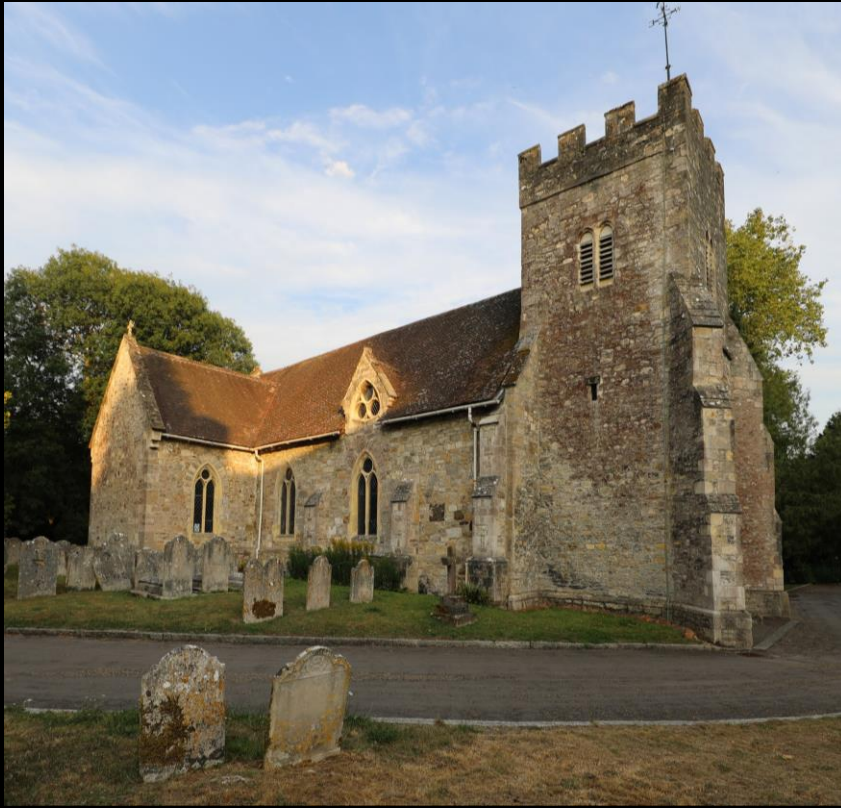
St. Mary's Church, South Stoneham.