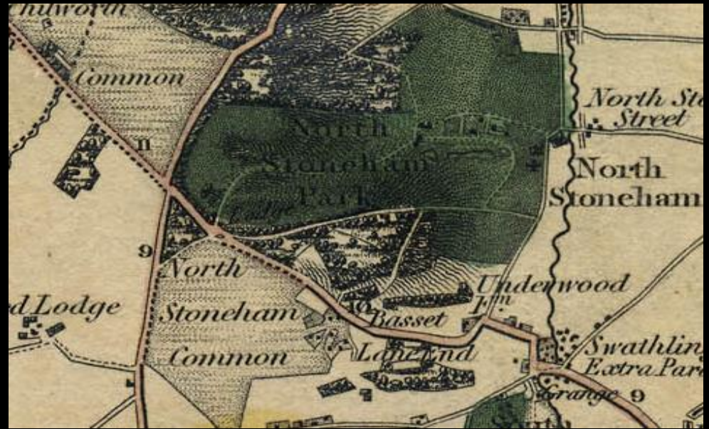
North Stoneham Park.