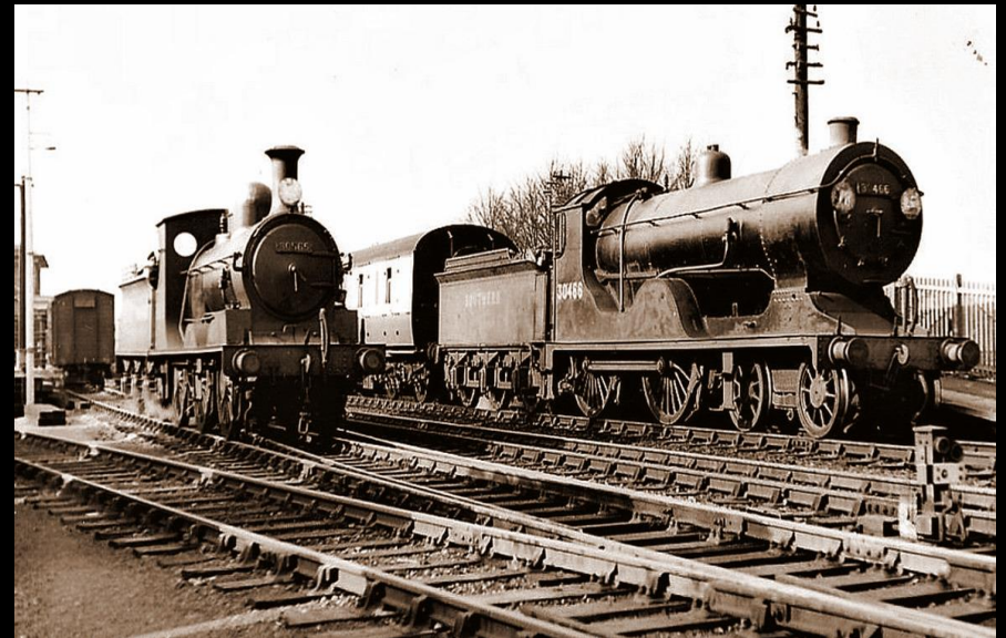
30466 - Drummond LSWR Class D15 4-4-0 seen here at Romsey with Class 0395 No.30565