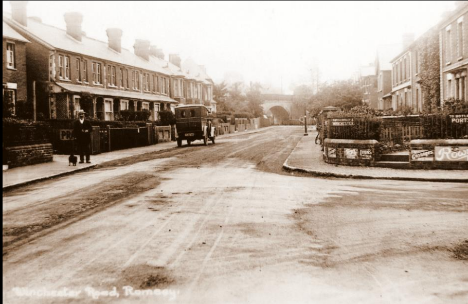
Winchester Road c. 1911