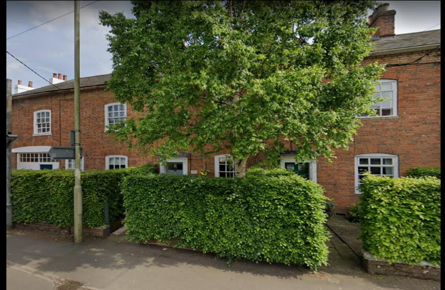
75 Winchester Road today