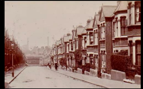
59 Huntsmoor Road